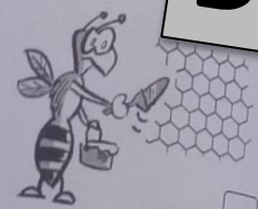
make the comb